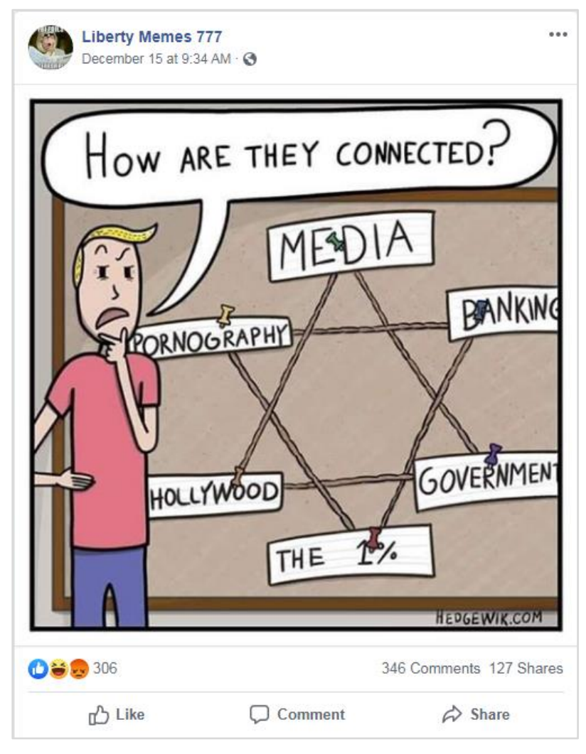
A meme posted to Facebook in December 2019 alleging a global Jewish conspiracy.

and remain focused on the alleged role of Jews behind the scenes, carrying out secret plans to dominate non-Jews.