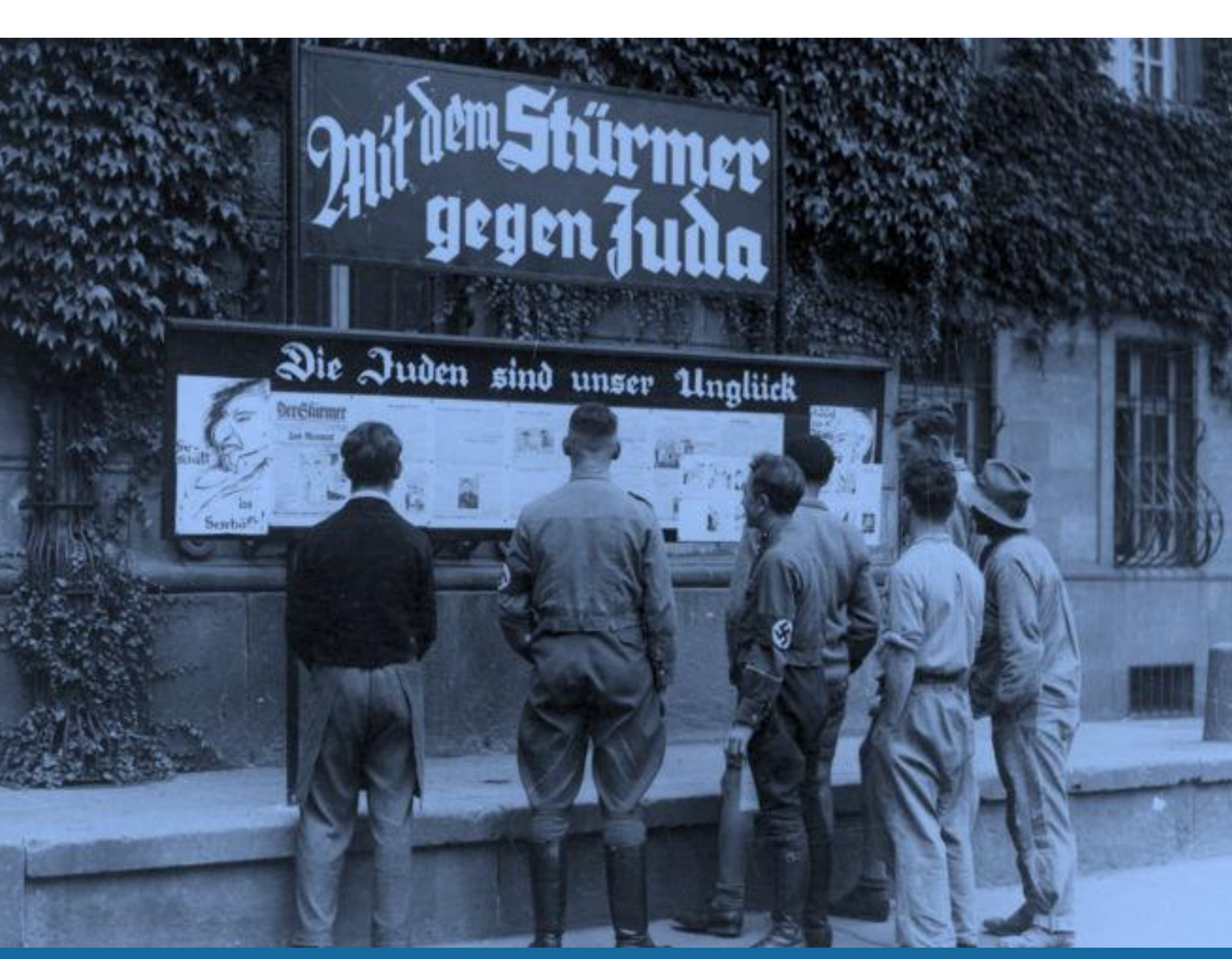
www.counterextremism.com | @FightExtremism