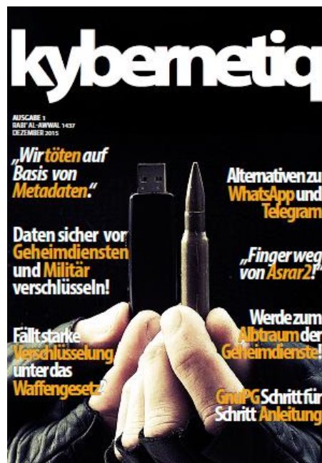
The cover of the first issue of the German-language Kybernetiq magazine.

The magazine suggests using the Amnesic Incognito Live System commonly known as “Tails,” as well as the GNU Privacy Guard encryption program. Tails—an operating system that ensures privacy and anonymity—can be used on personal computers via DVD or USB. The GNU Privacy Guard is a software application that encrypts all personal data and communications. It can be easily downloaded for free. (Sources: Site Intelligence , International Business Times , Tails , GnuPG )