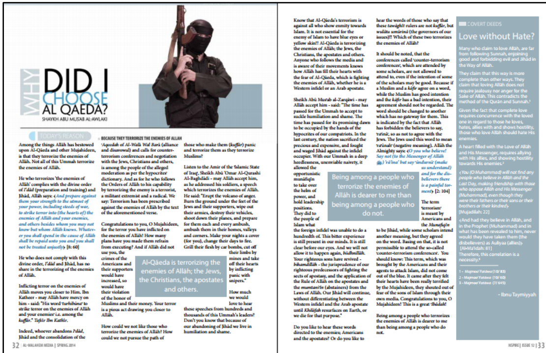
A page from Inspire ’s Spring 2014 issue

Awlaki, the “bin Laden of the Internet,” produces Inspire ’s content as a self-help manual for jihadists. The perpetrators of the 7/7 bombings— the 2005 London suicide attacks that killed 52—claim they researched bomb-making methods at home and were inspired by “[Awlaki]’s rallying cry of ‘just do it.’” Awlaki is also believed to have influenced Fort Hood shooter Nidal Hassan , Times Square bomber Faisal Shahzad , Charlie Hebdo shooters Chérif Kouachi and Saïd Kouachi , and Orlando shooter Omar Mateen , among dozens of other American and European extremists. CEP continues to identify these individuals in its online resource, Anwar al-Awlaki’s Ties to Extremists . (Sources: Guardian , Defense One , Jihadology , Washington Post , Long War Journal , CNN , ICSR , Daily Mail , Huffington Post , USA Today )