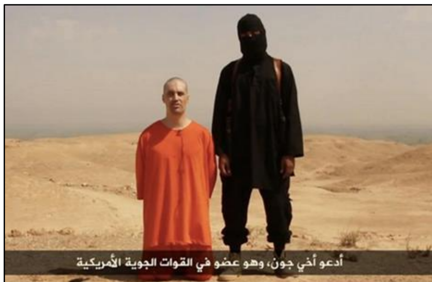
Screen grab from “A Message To America”

ISIS posts a video to YouTube titled “A Message To America” showing ISIS militant Jihadi John beheading American journalist James Foley. The video concludes with the fighter threatening to kill American journalist Steven Sotloff, another hostage held by ISIS. YouTube removes the video the same day, but jihadist web forums, shock sites, and blogs have already reposted it. The Foley video is the first in a series of beheading videos in which Jihadi John graphically beheads Western hostages. (Sources: New York Times , CNN )