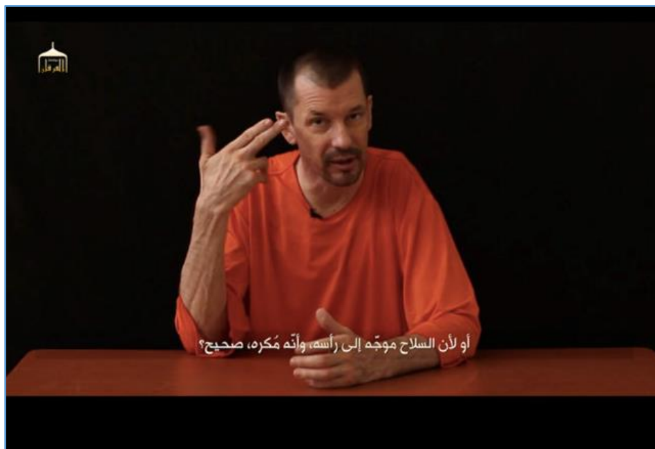
John Cantlie in an episode of “Lend Me Your Ears”

In a few videos separate from the series, Cantlie is portrayed as a Western journalist in regular clothing, reporting on ‘favorable’ conditions in Mosul and Kobani. Indeed, ISIS has used Cantlie to its advantage, turning him into a perpetual propaganda machine. (Sources: BBC , Daily Mail , RYOT News + Action )