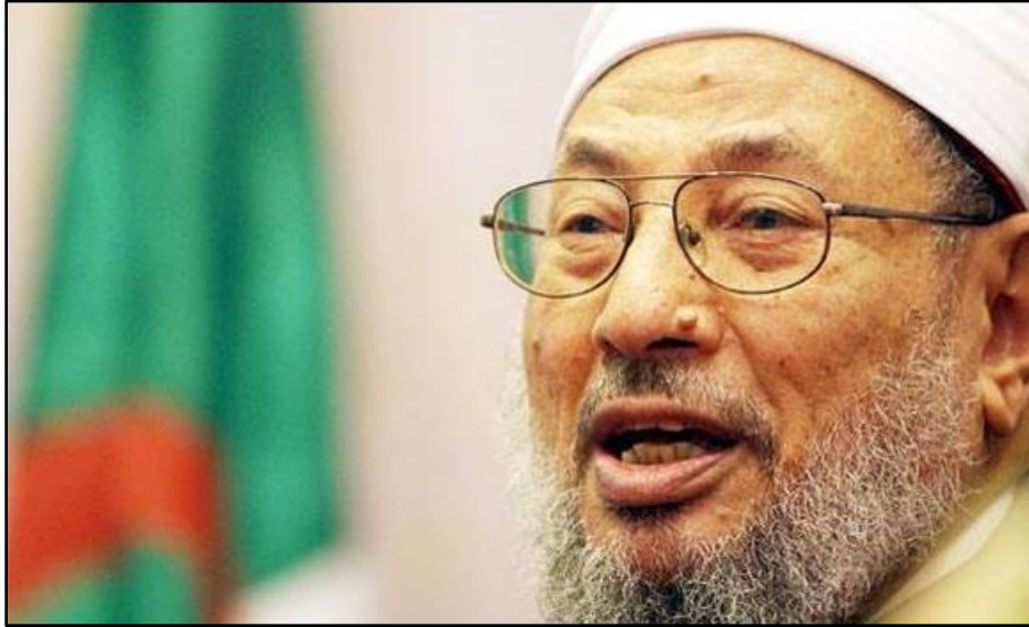
Yusuf al-Qaradawi

(Sources: Guardian , MEMRI , Guardian , Middle East Forum , Spiegel )