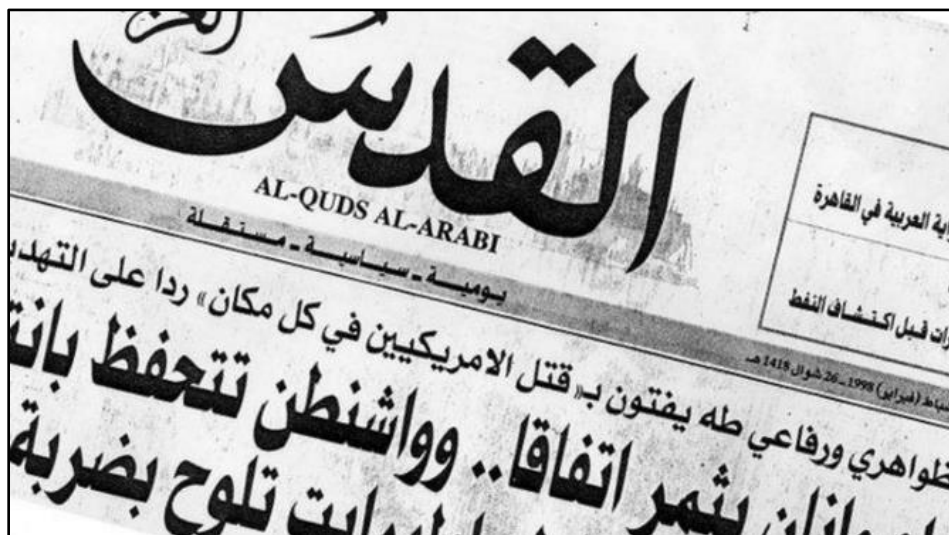
Bin Laden's second fatwa published in Al-Quds al-Arabi newspaper