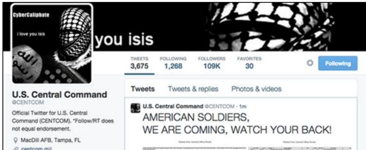
CENTCOM's hacked Twitter account

The main suspect in the hacking is Junaid Hussain , a young man from Birmingham, England, who is believed to have been in Syria at the time of the hacking. Hussain pleaded guilty in 2012 for publishing former Prime Minister Tony Blair’s address book. (Sources: Bloomberg , Guardian , Washington Post )