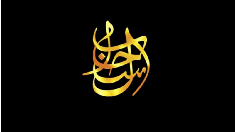
As-Sahab Media Department Logo