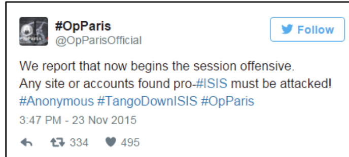
Anonymous launches “OpParis” following ISIS’s November 13 attacks in Paris