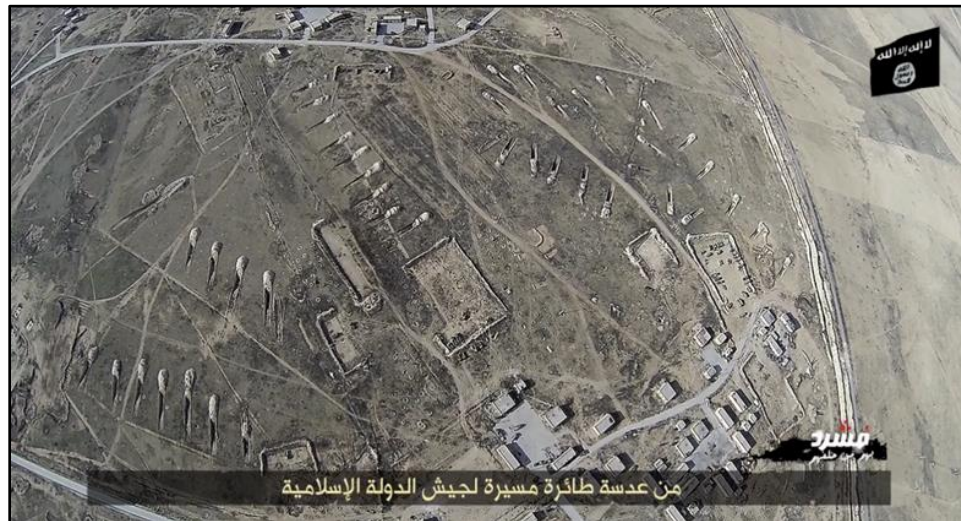
Screen grab from ISIS’s video purportedly showing footage shot by an ISIS-controlled drone

An ISIS web forum releases a promotional video demonstrating the terror group’s purported deployment of remote-controlled drones. The 14-minute video includes aerial shots of disputed regional territory allegedly filmed by ISIS-owned drones, which the terror group allegedly uses for reconnaissance. In December 2014, ISIS releases its second video including footage from remote-controlled drones, this time of the aerial view of the Syrian Kurdish town Kobani. (Sources: International Business Times , Telegraph )