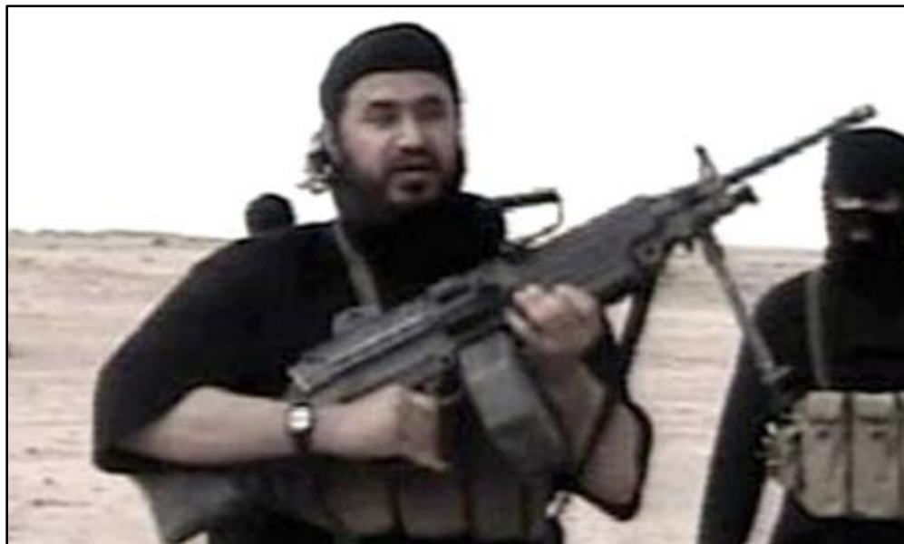
Abu Musab al-Zarqawi

instantaneously online.” (Sources: Washington Post , BBC , MIT Technology Review , Washington Post )